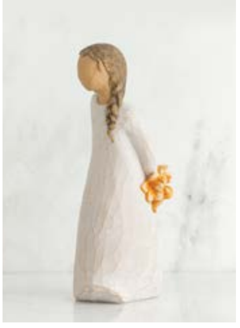
27672 For You Just a little something... Height: 13.5cm