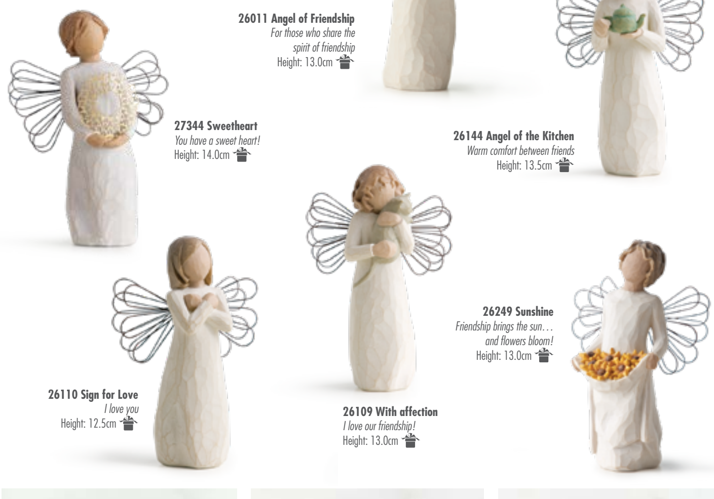
Willow Tree angels speak in quiet ways to heal, comfort, protect and inspire.