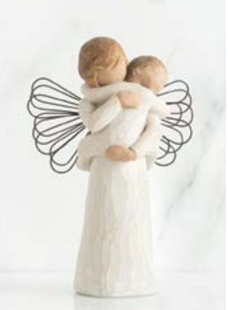
26084 Angel's Embrace Hold close that which we hold dear Height: 14.0cm