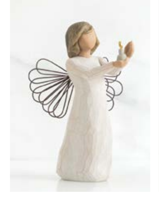
26235 Angel of Hope Each day, hope anew Height: 13.0cm