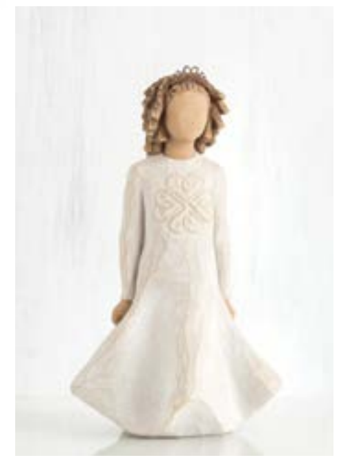
26245 Irish Charm May luck and laughter light your days! Height: 13.5cm