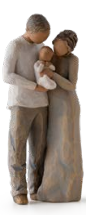
27268 We are Three It used to be just you and me. Now we are three — a family! Height: 22.0cm

26031 Father and Daughter Celebrating the bond of love between fathers and daughters Height: 11.5cm