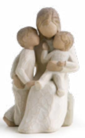
26100 Quietly Quietly encircled by love Height: 13.5cm

26250 The Quilt Sleep my child and peace... peace... Covered in love and keep... keep... Height: 14.0cm 省