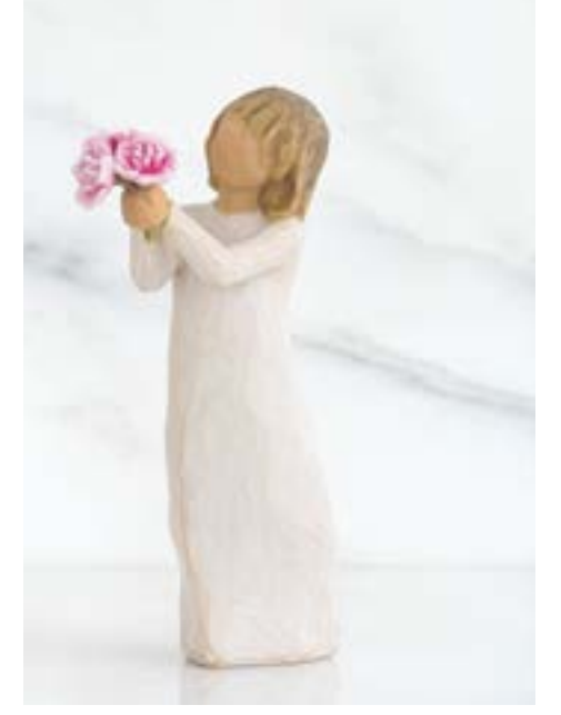
27267 Thank You So appreciative of all you do! Height: 14.0cm