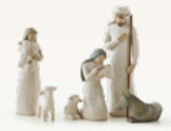
26005 Nativity Behold the awe and wonder of the Christmas Story Maximum Height: 23.0cm