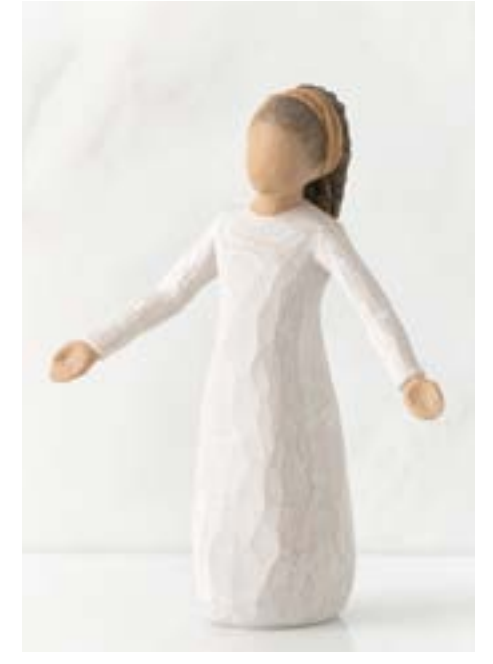
26186 Blessings Each day, unexpected blessings Height: 14.0cm