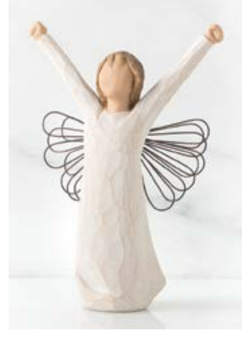
26149 Courage Bringing a triumphant spirit, inspiration and courage Height: 14.5cm