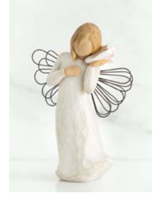
26131 Thinking of You Keeping you close in my thoughts Height: 13.5cm