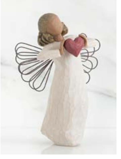
26182 With Love You are loved Height: 13.5cm