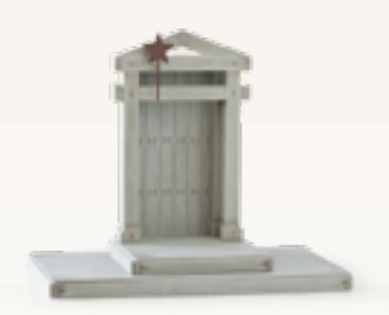
26106 Crèche Height: 43.0cm, Length: 51.0cm Depth: 29.0cm