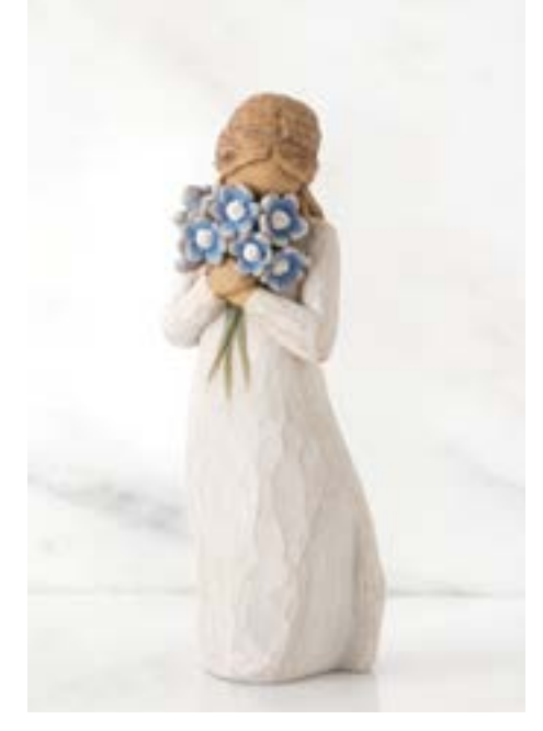
26454 Forget-me-not Holding thoughts of you closely Height: 13.5cm 👚