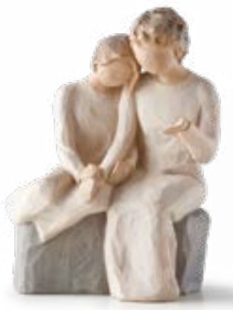
26244 With my Grandmother The best gift is time spent with you Height: 14.5cm

26167 Generations Making memories that last lifetimes Height: 18.0cm 眷