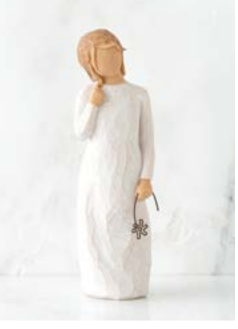
26171 Remember Always, I will remember... Height: 14.0cm 👚