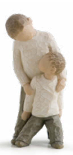
26056 Brothers Forging a bond that lasts a lifetime Height: 13.0cm 眷

26228 Caring Child ... nurtured by your loving care Height: 7.5cm 眷