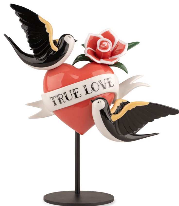
TRUE LOVE 01009534 30 x 31 x 15 cm 11¾" x 12¼" x 6" Base Included

We are introducing the first piece in the Ink collection inspired by the age-old custom of drawing messages on the skin. The first known tattoos date back over five thousand years ago and cultures all over the world have used this technique to make offerings to the gods, to mark social rank, to express values or to perpetuate feelings. The Ink creations are based on this tradition which has accrued newfound popularity today. This first piece is decorated with the bright primary colors associated with old school US illustrations from the 1930s.