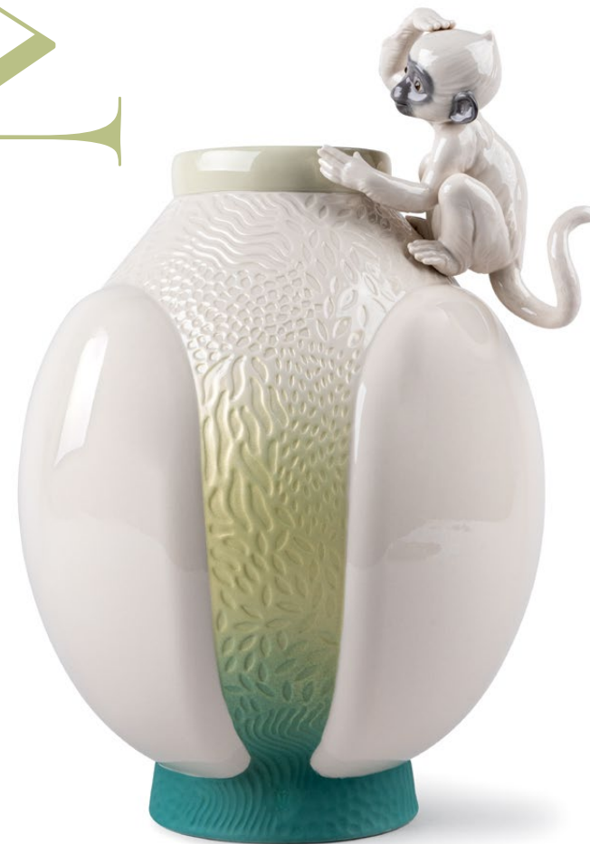
MONKEY VASE 01009499 42 x 26 x 24 cm 16½" x 10¼" x 9½"