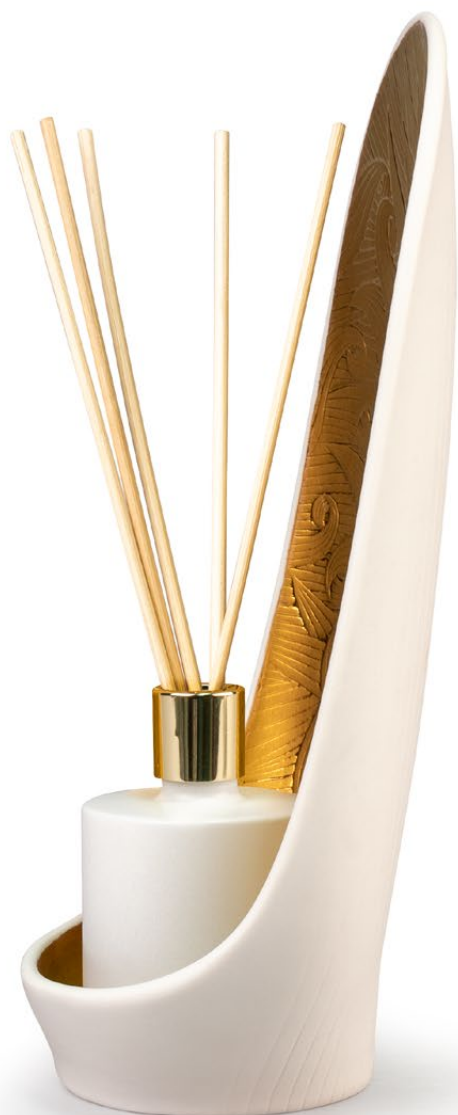
PERFUME DIFFUSER MIRAGE - MOONLIGHT 01040253 28 x 21 x 10 cm 11" x 8¼" x 4"

The Mirage collection grows with this version for perfume diffusers that are framed against porcelain, decorated with golden luster and etchings that evoke flames of fire and their constant flickering.