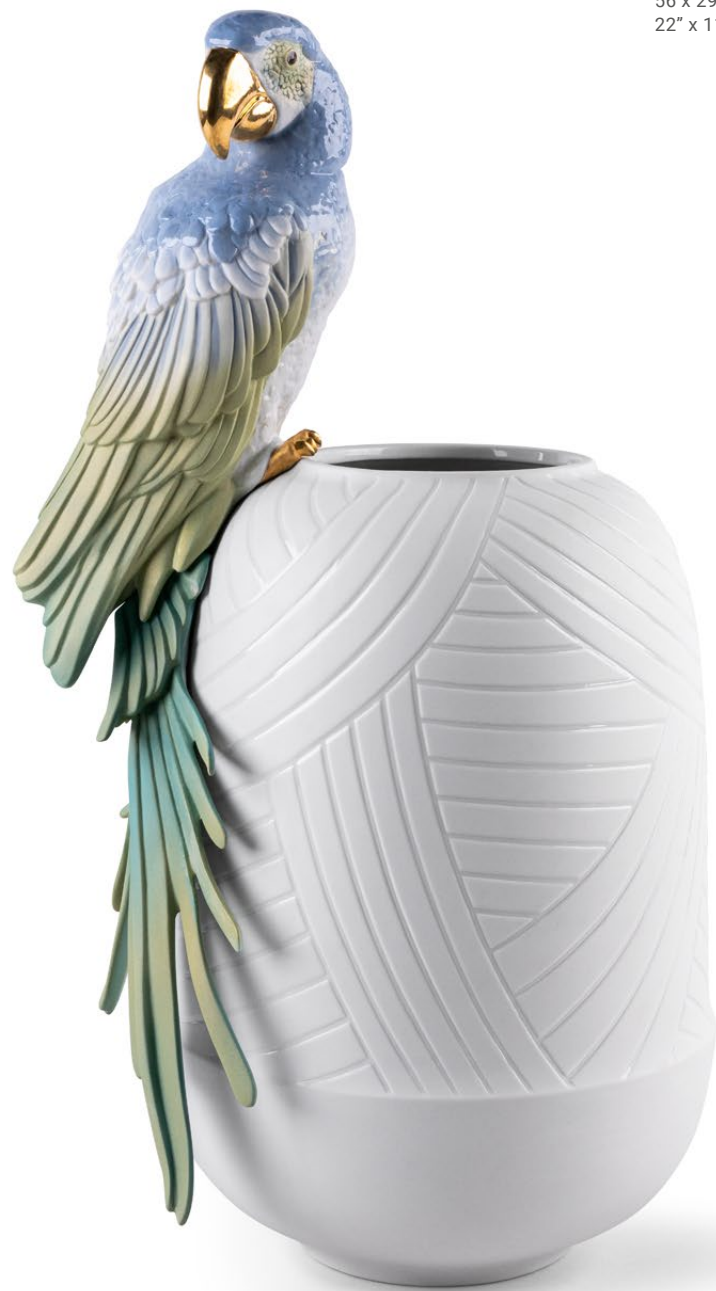
MACAW BIRD VASE 01009540 56 x 29 x 24 cm 22" x 11½" x 9½"

The brand's series of vases is expanded with new additions.