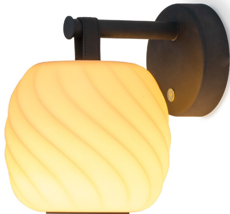
ICE CREAM WALL LIGHT 01024132 (CE/UK) 01024133 (US) 01024134 (JP) 26 x 17 x 17 cm 10¼" x 6¾" x 6¾"

The Ice Cream collection is expanded with this version for hanging on the wall. The lamps in these series, inspired by the wavy curves of ice cream and by traditional Japanese paper lanterns, play with porcelain's translucent quality to give off a particularly warm light.