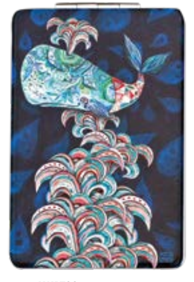
AW1789 WHALE COMPACT MIRROR Length 9.0cm