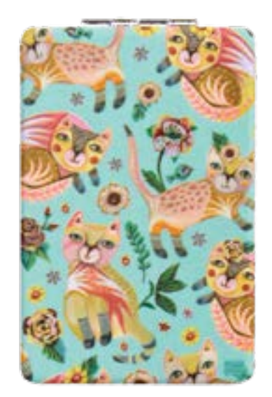
AW1971 KITTY LOVE COMPACT MIRROR Length 9.0cm