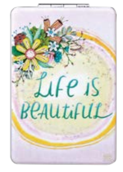
AW1785 LIFE IS BEAUTIFUL COMPACT MIRROR Length 9.0cm