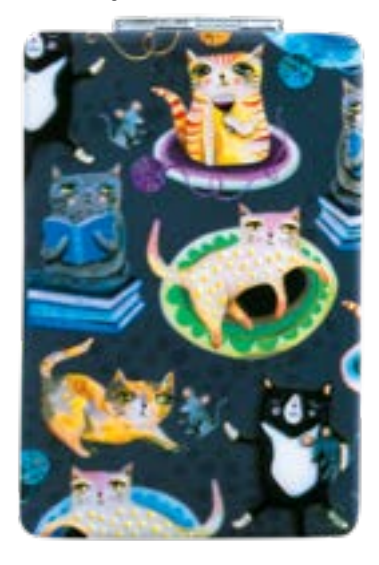
AW2072 CRAZY CATS COMPACT MIRROR Length 9.0cm