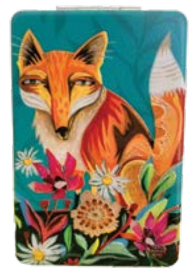
AW2107 FOX AND FLOWERS COMPACT MIRROR Length 9.0cm

AW2101 BEYOUTIFUL COMPACT MIRROR Length 9.0cm