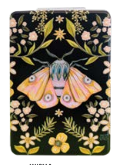
AW2115 BLACK MOTH COMPACT MIRROR Length 9.0cm