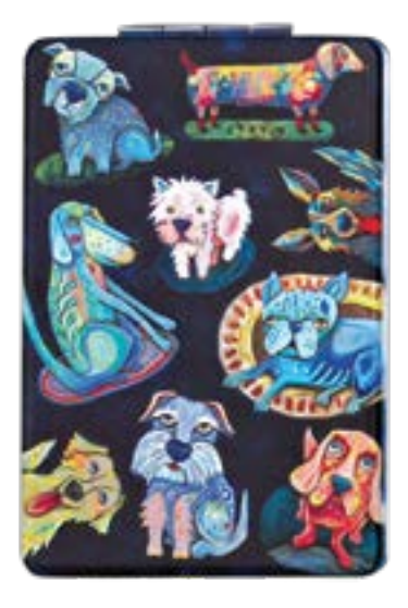
AW1781 DOG PARK COMPACT MIRROR Length 9.0cm