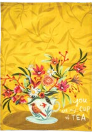
ARTT2111 CUP OF TEA TEA TOWEL Length 70.0cm Machine/hand washable