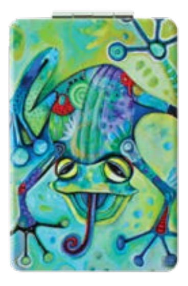
AW1839 FROG COMPACT MIRROR Length 9.0cm