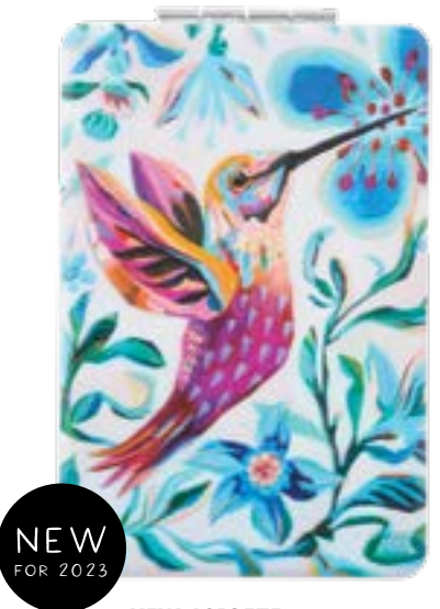
NEW 6013575 HUMMINGBIRD COMPACT MIRROR Length 9.0cm

NEW 6013574 TOUCAN COMPACT MIRROR Length 9.0cm