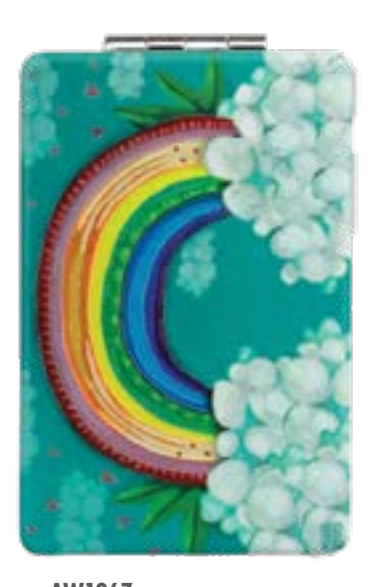
AW1967 RAINBOW COMPACT MIRROR Length 9.0cm