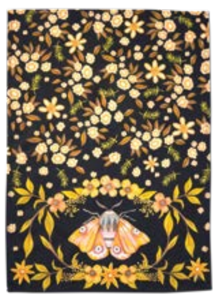
ARTT2017 BLACK MOTH TEA TOWEL Length 70.0cm Machine/hand washable