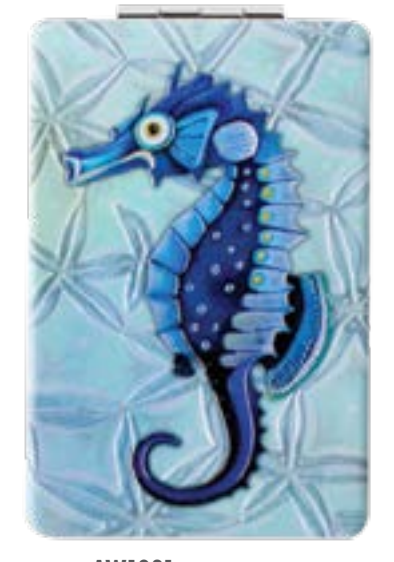
AW1831 SEAHORSE COMPACT MIRROR Length 9.0cm