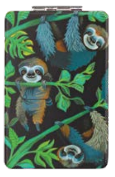
AW1965 SLOW POKE COMPACT MIRROR Length 9.0cm