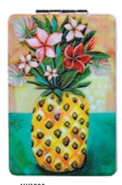
AW1980 PINEAPPLE COMPACT MIRROR Length 9.0cm