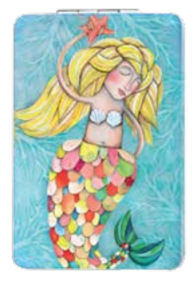
AW1787 MERMAID COMPACT MIRROR Length 9.0cm