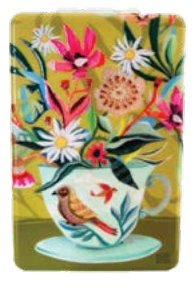
AW2103 CUP OF TEA COMPACT MIRROR Length 9.0cm