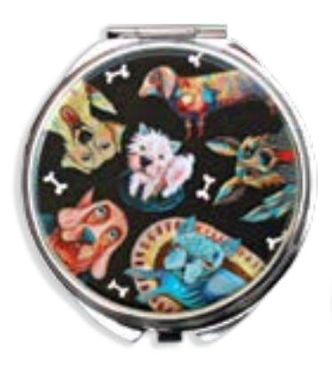
AT1852 DOG PARK TRINKET BOX Diameter 6.0cm