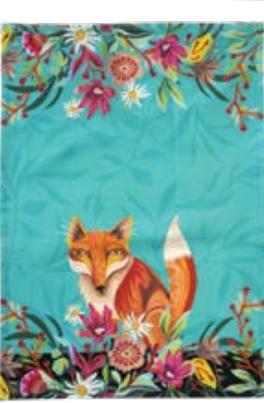
ARTT2113 FOX AND FLOWERS TEA TOWEL Length 70.0cm Machine/hand washable