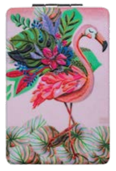
AW1983 FLAMINGO COMPACT MIRROR Length 9.0cm