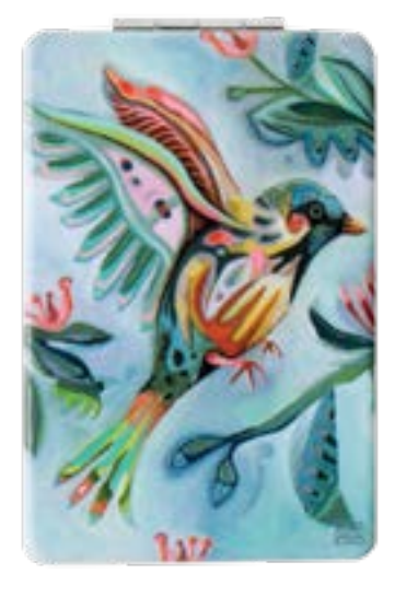
AW1841 BIRD COMPACT MIRROR Length 9.0cm