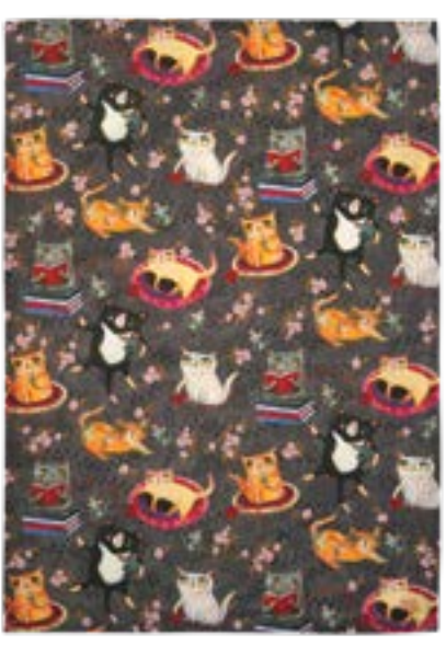
ARTT2001 CRAZY CATS TEA TOWEL Length 70.0cm Machine/hand washable

ARTT1835 HELLO FISH TEA TOWEL Length 70.0cm Machine/hand washable