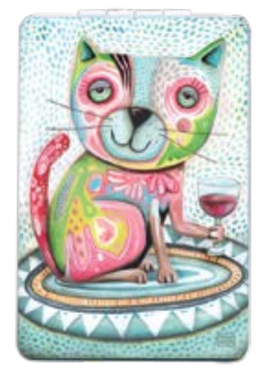
AW1782 CAT WINE COMPACT MIRROR Length 9.0cm