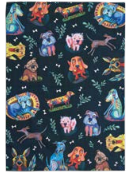
ARTT1833 DOG PARK TEA TOWEL Length 70.0cm Machine/hand washable