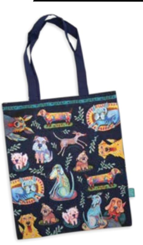
ARB2054 DOG PARK TOTE BAG Height 42.0cm Machine wash cold, line dry