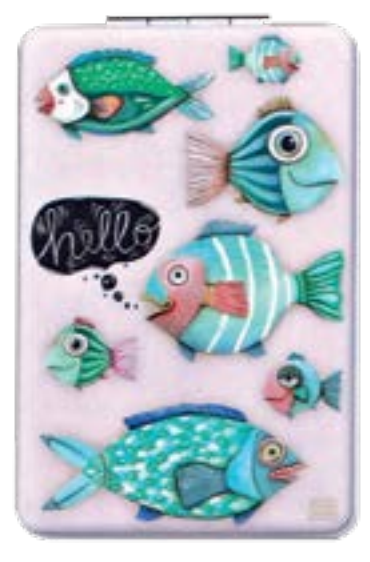
AW1786 HELLO FISH COMPACT MIRROR Length 9.0cm