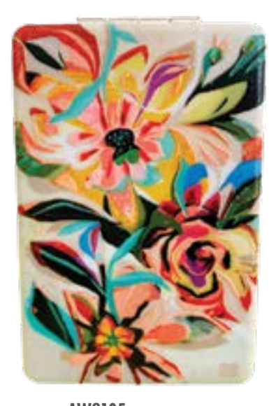
AW2105 FLORAL POP COMPACT MIRROR Length 9.0cm