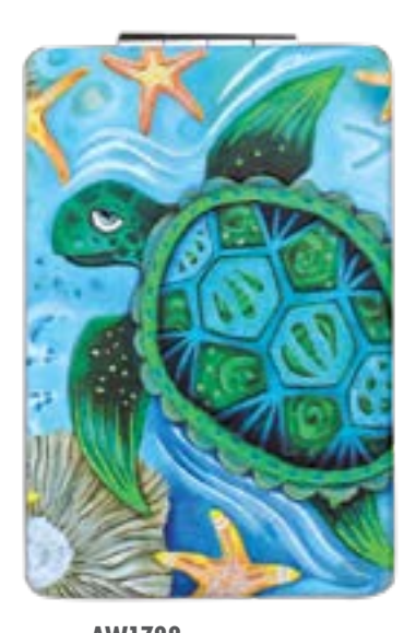
AW1788 TURTLE COMPACT MIRROR Length 9.0cm