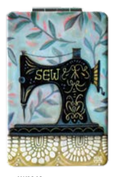
AW1843 VINTAGE STITCH COMPACT MIRROR Length 9.0cm